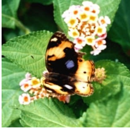
A South African Butterfly — The Yellow Pansy

Please write to the magazine editor if you have any observations or opinions on butterfly behaviour that you would like to share with us on this topic.