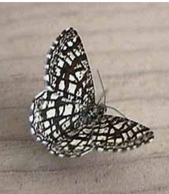
Latticed Heath— Semiothisa clathrata .

The benefits for lepidoptera were also apparent and a total of 14 butterfly species were seen. Green Hairstreak, one of the main target species was seen in both main sections of the reserve & also in a small clearing on the Ridgeway path which links the two - 8 adults in total. Grizzled Skippers were in the northern, less accessible clearing - 7 in total. We were also pleased to see Dingy Skipper (6) & Brown Argus (5) present in both sections of the reserve. Other species noted included Small Heath (7), Small Copper (5), Brimstone (15), Green-veined White (2), Orange Tip (2), Holly Blue, Large White, Speckled Wood (3), Small Tortoiseshell & Peacock (3).