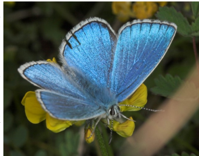
Male Adonis Blue

Sunday was the day we went to 'The Track', an old disused railway line which runs along the edge of Boscombe Down airfield - and is now a BC reserve. We used to live within walking distance of here, and knew to expect another of my favourites - the Adonis Blue. In fact, it was the most common butterfly as we walked along, perhaps seeing a hundred or so. The females are brown, and are therefore much less conspicuous. The banks of this track are covered with horseshoe vetch, which was all in flower, and made a wonderful sight next to the blues and purples of the chalk milkwort.