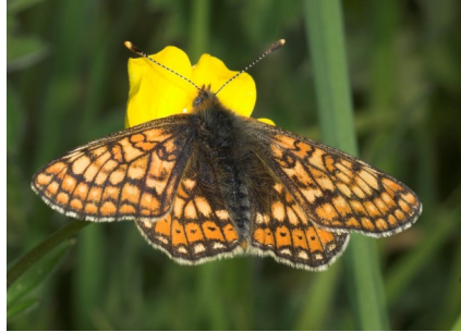
Marsh Fritillary

By now there were several sunny intervals, and butterflies were beginning to come out of hiding. Speckled Yellow moths were plentiful as we headed for a clearing where we had seen good butterflies many years earlier. Whenever the sun appeared - so did the fritillaries! The majority were Small Pearl-bordered, and these still looked very fresh, but there were also good numbers of the paler, and straighter-winged, Pearl-bordered fritillaries. At first, I didn't think we would be able to see any at rest to confirm identification, let alone to photograph. However, we found that both species would come down to nectar on Bugle, and so all we had to do was find some, and then lie in wait! Then we could be surrounded by several busily nectaring at the same time.