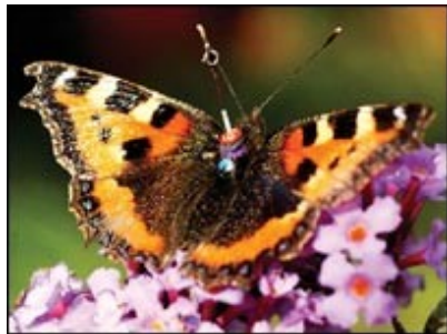
Small Tortoiseshell with radar transponder