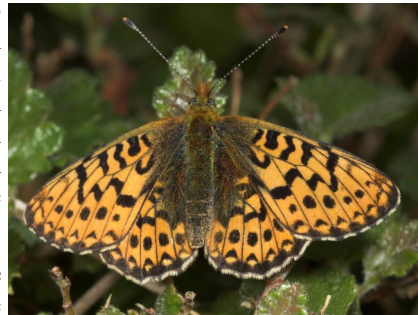
Small Pearl-bordered Fritillary

Sunday was the day we went to 'The Track', an old disused railway line which runs along the edge of Boscombe Down airfield - and is now a BC reserve. We used to live within walking distance of here, and knew to expect another of my favourites - the Adonis Blue. In fact, it was the most common butterfly as we walked along, perhaps seeing a hundred or so. The females are brown, and are therefore much less conspicuous. The banks of this track are covered with horseshoe vetch, which was all in flower, and made a wonderful sight next to the blues and purples of the chalk milkwort.