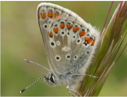
Brown Argus